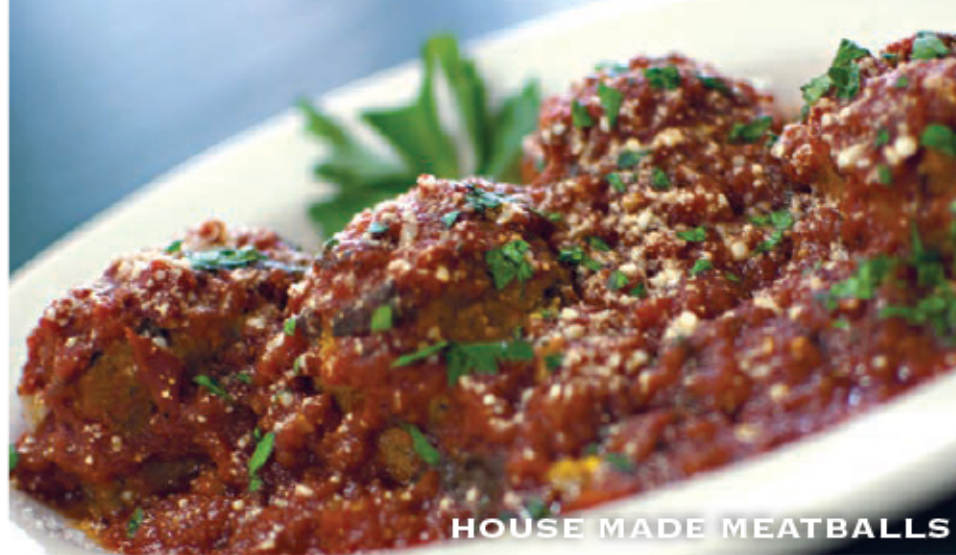
HOUSE MADE MEATBALLS