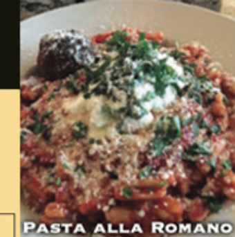
PASTA ALLA ROMANO